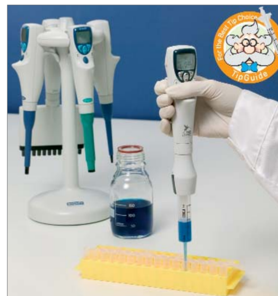
Figure.2. Versatile eLINE pipettor and dispenser family.

On the contrary to manual tip removal in other models, the tip is ejected electronically and the buttons are placed precisely for minimal exertion. The design is symmetric allowing similar use with the left or right hand from various pipetting positions. Furthermore, the volume setting can be done electronically.