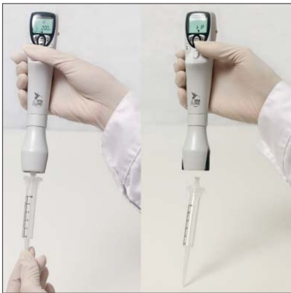
Figure 3. Light tip attachment and unique electronic tip ejection make eLINE dispenser the most ergonomic dispenser on the market.

In manual dispensers the dosing button is manually lifted all the way up (approximately 5 cm) to aspirate the liquid and the thumb then moves up and down controlling the plunger in dispensing. The repeated lifting and thumb pressings of the operating button demand strong total force. The force needed for one full aspiration in mechanical dispensers is at least 15 times more compared to electronic dispensers. For dispensing one aliquot there is another 15-fold difference, which is repeated easily 100 times in a typical dispensing cycle. Moreover, with electronic dispenser, 100 x 100 µl can be done with single aspiration, whereas manual dispenser requires an additional aspiration and dispensing cycle, adding workload. This 15 N (1.5 kg) force for single dispensing may be done hundreds of times, many hours a day, several times a week - no wonder Repetitive Strain Injuries start to develop. With electronic dispensers, both the aspiration and dispensing force is practically eliminated as operation is controlled electronically by simply touching the operating buttons.