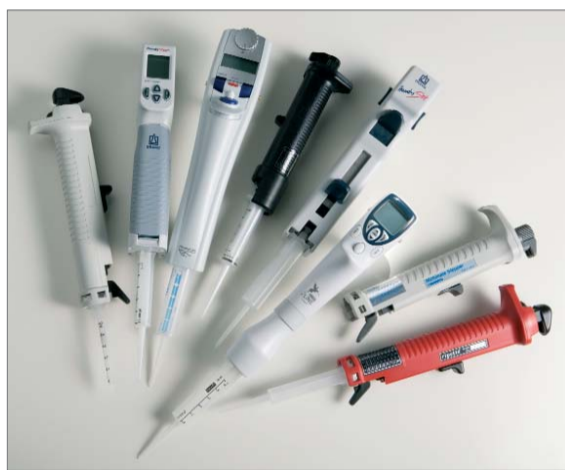
Figure.1. Selection of dispensers available on the market.

The demand for higher and higher throughput is a concern in all laboratories today and fully automated instruments would seem like the best choice. However, many laboratories need to establish several research or screening programs differing significantly from each other, both in application and volume range. Different samples regarding toxicity, risk of contamination and viscosity make the choice even more important – and difficult. Money is always a limiting factor as well.